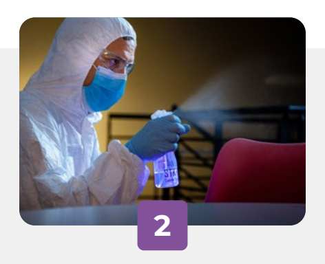
Spray victim's body at a distance of ~20 cm (~8 inches)