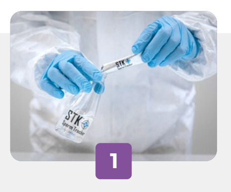
Dilute 1 pouch of STK Skin in 100 ml (~3 US fl oz) of demineralized water